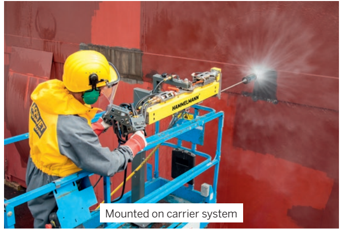
Mounted on carrier system