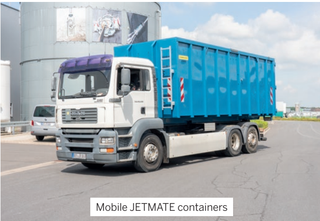
Mobile JETMATE containers