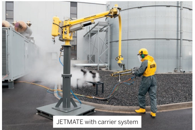
JETMATE with carrier system