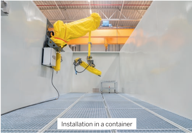
Installation in a container